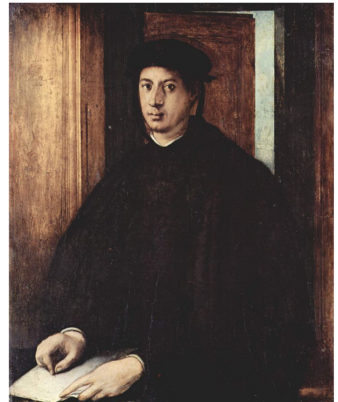
Alessandro de' Medici (1510–1537) Portrait by Jacopo Pontormo.

Among his many written works, Guicciardini is best known as the author of the Storia d'Italia (The History of Italy) , which provides a detailed account of politics in the Italian Peninsula between 1490 and 1534. Written during the last years of his life, this work contains the historian's observations collected over his entire lifetime and was a work intended for posterity. As Gilbert writes: " The History of Italy stands apart from all his writings because it was the one work which he wrote not for himself, but for the public." [Felix Gilbert, Machiavelli and Guicciardini: Politics and History in Sixteenth-Century Florence (Princeton, 1985)].