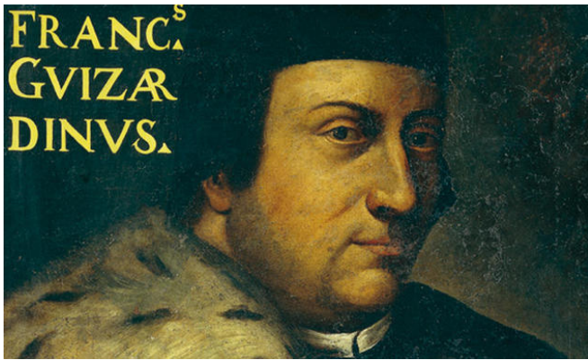
Francesco Guicciardini (Painting by Vincenzo Camuccini)

For this month's Alla Corrente, I decided to choose one of the friends of Machiavelli who also served as a diplomat for Italian city-states. Since I gave a presentation on Machiavelli's The Prince at the February 27 luncheon, this piece on Guicciardini adds another perspective to the politics of the Italian Renaissance during the first half of the 16th century. Also, since this is the March Bulletin, I chose Guicciardini because he was born in March of 1483.