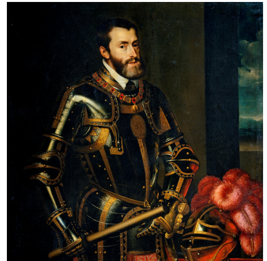
“Emperor Charles V with a Baton,” by Juan Pantoja de la Cruz [copy of a portrait by Titian (Tiziano Vecellio, 1490-1576)].